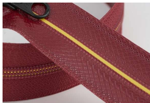
T Two-tone color patented TPU-SEAL waterproof zipper

Moreover, TPU waterproof layer can simplify welding process and lower the cost; this special item can upgrade the garment to a craft level which garment industry can't reach originally. The following items and their applications will be exhibited: