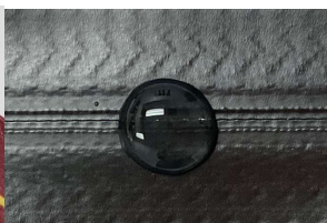
T1 Solid color TPU-SEALTM1F fabric-like patented waterproof zipper TPU-SEAL waterproof zipper